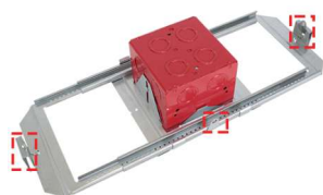
Designated Holes for Branch Line Restraints (Use as application requires)