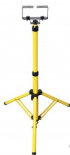
LTL-TS (Sold Separately)