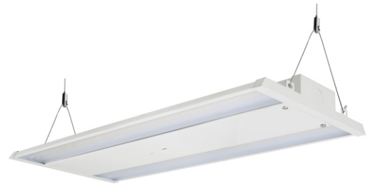
Suspension Kit Included

The LLHB3 is a simple, light designed LED Linear High Bay with better cooling design and high lumen efficiency, ideal for commercial areas such as warehouse, exhibition hall, gymnasiums, or super market. It uses aluminum alloy punched to a very thin and light fixture. Motion Sensor and Emergency Backup Optional. UL listed for damp location. DLC 5.1 Premium Listed.