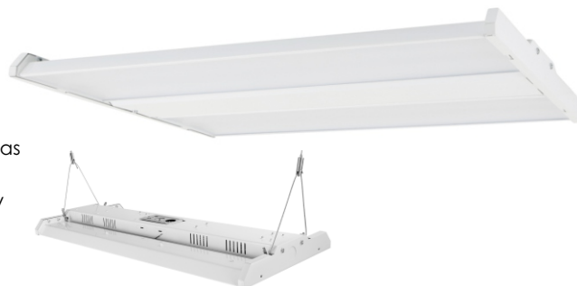
Suspension Kit Included

The LLHB2-FL is a simple, light designed LED Linear High Bay with better cooling design and high lumen efficiency, ideal for commercial areas such as warehouse, exhibition hall, gymnasiums, or super market. It uses aluminum alloy punched to a very thin and light fixture. Motion Sensor and Emergency Backup Optional. UL listed for damp location.