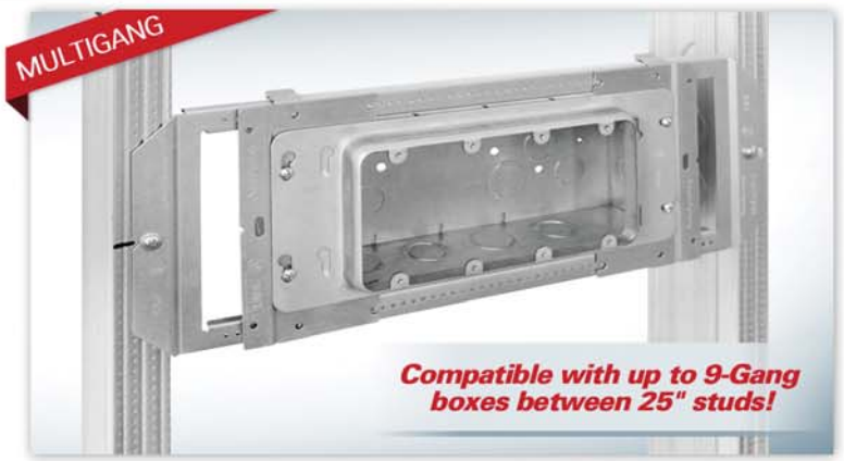
Compatible with up to 9-Gang boxes between 25" studs!