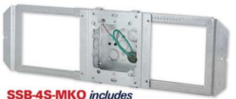
SSB-4S-MKO includes 4" Square Box with MKOs (combination 1/2" & 3/4" KO)