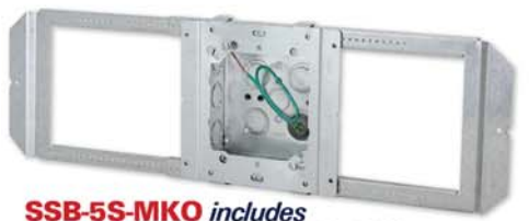
SSB-5S-MKO includes 4-11/16" Square Box with MKOs (combination 1/2" & 3/4" KO)