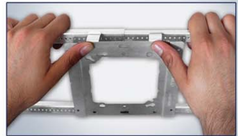
Adapter easily clips onto bracket