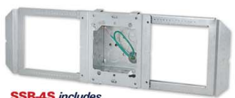
SSB-4S includes 4" Square Box with 1/2" & 3/4" KOs