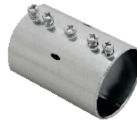
1-1/4" to 4"