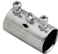
1/2" to 1"