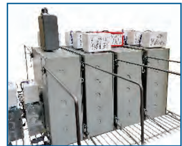
Shown fabricated with pre-wired lighting relay devices, ready-to-install