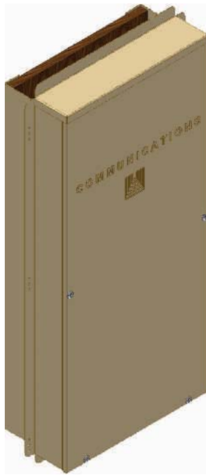
UM1400D (6" Deep)