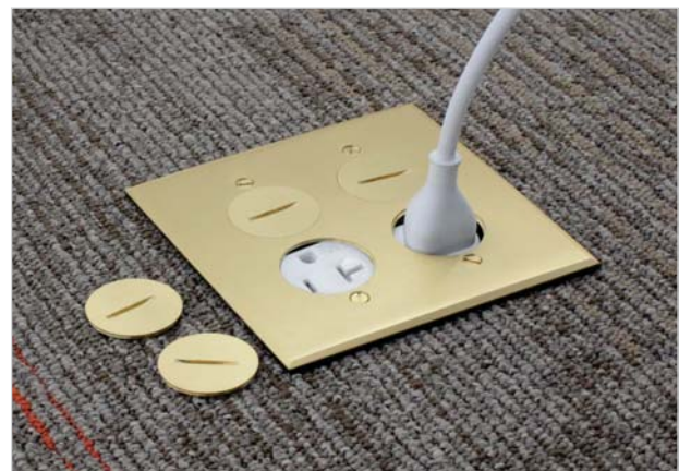
FLB-R2G-DD-BR Shown Installed Adjustable 0" - 1"