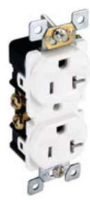
Tamper Resistant CR20-TR