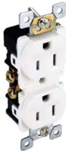
Tamper Resistant CR15-TR