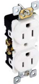
Tamper Resistant R15-TR