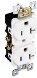
Tamper Resistant R20-TR