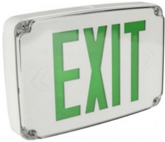
Catalog#: ESLN4M MICRO WET LOCATION LED EXIT SIGN

Category Exit Sign & Emergency Light Combo Page J15