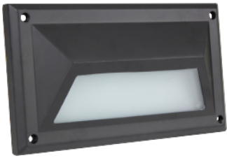
Catalog#: S711C STEP LIGHT FACE PLATE