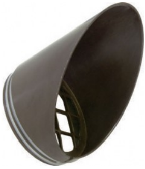
Catalog#: FG38V FIBER GLASS VISOR FOR FGHL38