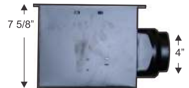
← 9 1/8" square →