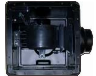
← 10 5/8" square →