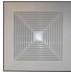
← 11 7/8" square →