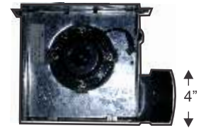
← 7 3/4" square →