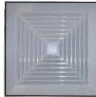
← 8 3/4" square →