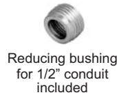
Reducing bushing for 1/2" conduit included