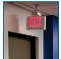
After Installation Prevents Rotation