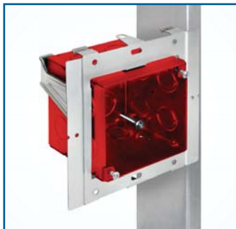
DIRECT TO STUD