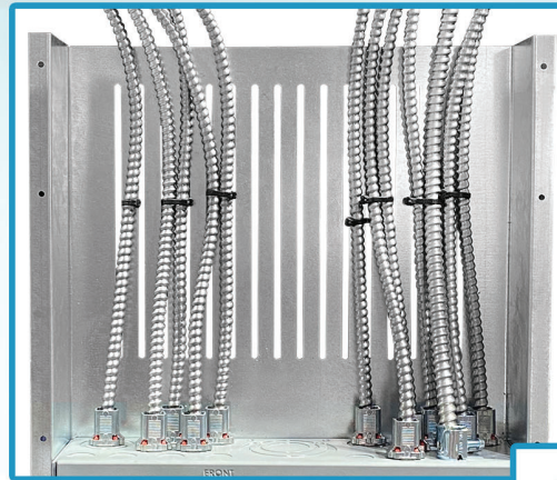
Vertical Cable Slots

Prepare Load Centers in the shop, ready-to-install on site!*