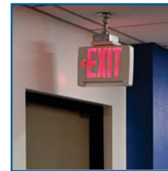
After Installation Prevents Rotation