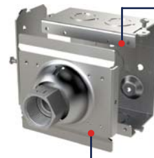
SWIVEL COVER PLATE