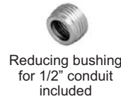
Reducing bushing for 1/2" conduit included