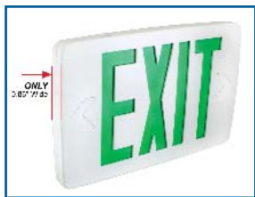
INCREDIBLY THIN, ONLY 0.86" WIDE

The EST is one of the slimmest LED Exit Signs on the market. Measuring 0.86" deep, the EST is roughly half the depth of standard exit signs. Despite its size, the EST meets all the same requirements and listings as standard models. Its low profile and elegant lines complement upscale interior decor.