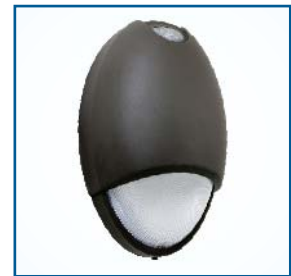
SHINE BRIGHT EVEN IN WET LOCATIONS