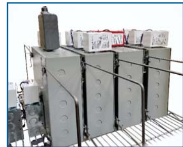
Shown fabricated with pre-wired lighting relay devices, ready-to-install