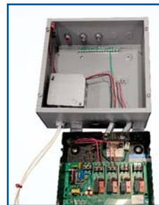
Shown fabricated to lighting panel, used as pull box