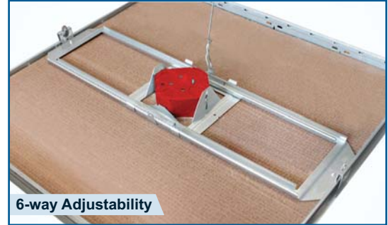
DROP CEILING (T-BAR)