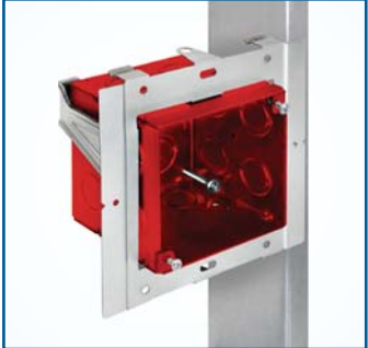
DIRECT TO STUD