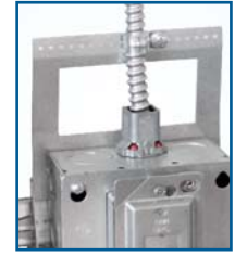
BARB-CS includes cable support pinholes