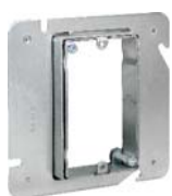
5AR1G-58 5AR1G-34 NEW