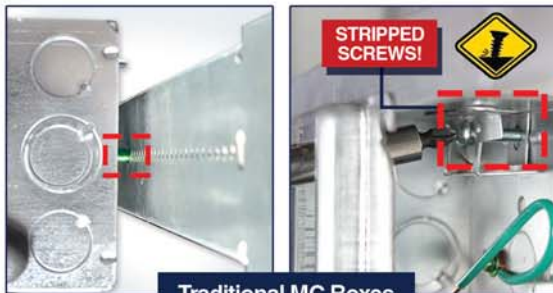
Traditional MC Boxes

Traditional MC boxes don't mount easily to bar hangers, due to ground screw interference. Straight clamp screws prevent installers from securing cable when the device ring is attached. Attempting to tighten clamp screws with the ring attached can strip screw heads - and even cause the installation to be re-worked!