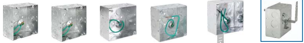
5SDB-MKO-PT 5SDB-MKO-PT-10 4SDB-MKO-PT 4SDB-MKO-PT-10 4SDB-MKO-PT-BSA