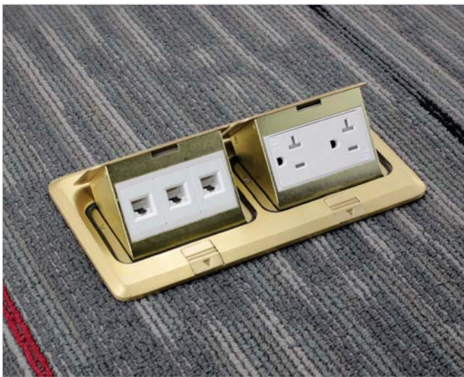
FLBPU-DL-BR Shown Installed Brass 2-Gang Pop-Up Floor Box