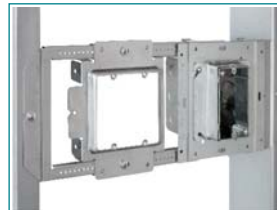
SHOWN INSTALLED BETWEEN STUDS ON SSB-T5 BRACKET