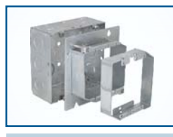
*SAR2G & 2GX75 Exploded View