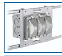
Multiple UPC-12MA shown installed on SSB-MB3 - Domed cover ideal for protecting Toggle Switch and other devices