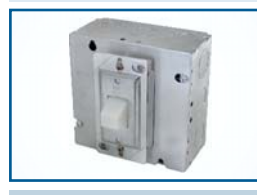
Complete UPC Assembly Shown Installed with Toggle Switch