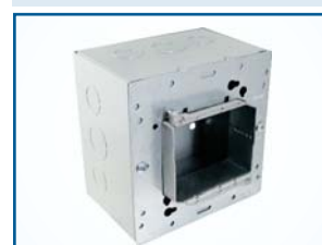
WBAR on the 6" x 6" NEMA Enclosure