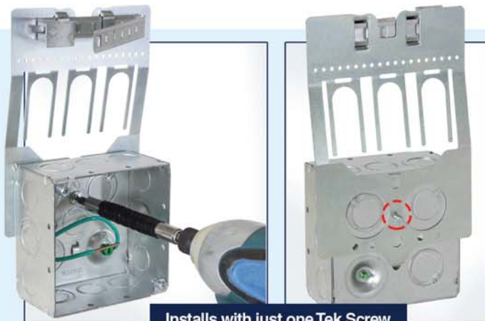
Installs with just one Tek Screw

Orbit's Box Mounted Conduit/Cable Support (BMCS) attaches directly to any size junction box for a cost saving solution to first means of support needs.