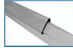
Extra bend ensures a sturdy design