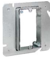
5AR1G-58 5AR1G-34 NEW