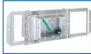
3GAR-34 Shown Installed on SSB-T5 with SDB-3 & UMA cut in half