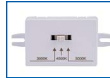
CCT Adjustment Switch Inside