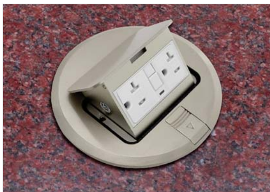
FLBPU-G-R-SS Shown Installed 1-Gang Pop-Up Type with GFCI